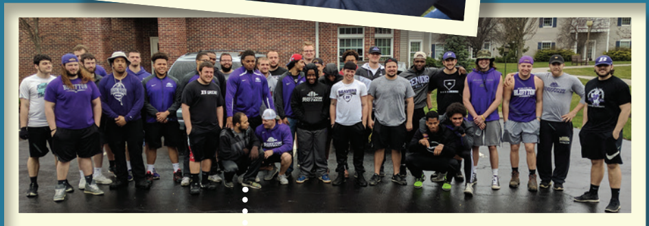
The Bluffton University football team has helped with grounds maintenance and other outdoor projects.