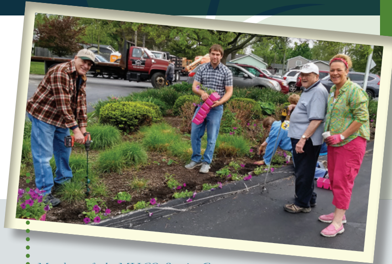
Members of the MHCO Service Group assist staff with seasonal landscaping projects.